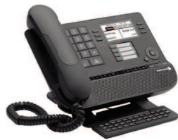
8028 IP / 8029 TDM Premium DeskPhone