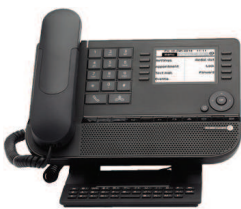
8038 IP / 8039 TDM Premium DeskPhone