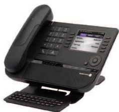
8068 IP Premium DeskPhone

Although many businesses haven't yet gone down this road, rest assured that when you migrate to IPv6 your Premium DeskPhones are ready. For those who have made the move to Energy Efficient Ethernet, the Premium DeskPhones supports this standard, contributing to your energy savings. And as privacy and security issues come to the fore more and more, many businesses will want to take advantage of the embedded encryption capabilities, as well as the assurance of SIP Survivability.